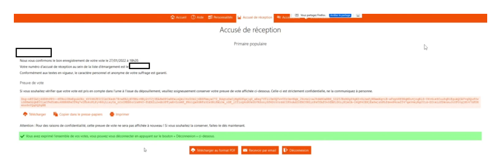
Fig. 3: The interface featuring the "proof of vote", with personal identification removed (this was recorded while in a screenshare with the rest of the team). All the big buttons on the bottom close the page, and downloading the receipt requires clicking on the text below the "proof of vote".

CNIL recommendation 2-07. The voting phase still featured a "proof of vote" as a receipt and stated that this receipt was only going to be shown once for confidentiality reasons. As shown on Figure 3, the system also had some design flaws. The three buttons at the bottom of the page state "download in pdf", "receive by email", and "log out". Clicking on them gives only a partial receipt that shows that one voted but does not indicate the "proof of vote", and it is by then too late to get the full receipt<sup>17</sup>. Even if one managed to download the full receipt, the question remained of what to do with it: no information was ever given (either by email or on any of the voting websites) with instructions on how to verify, and the verification website used for previous votes did not accept any of our receipt/login/password combinations.